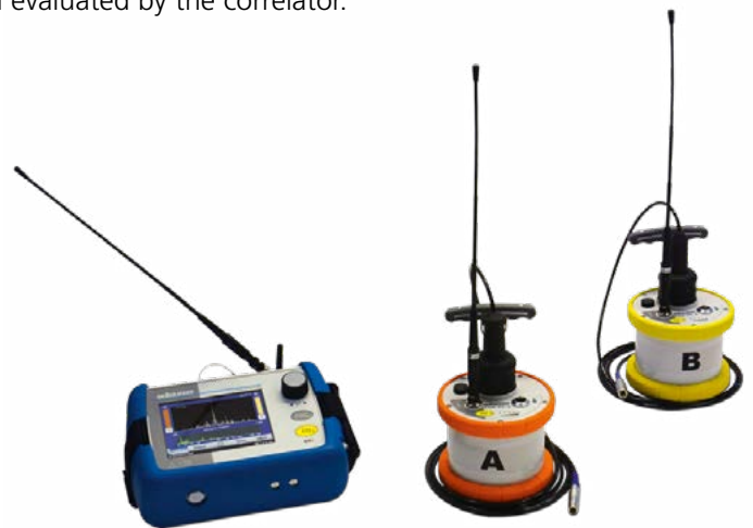
Power transmitters (transmitter and microphone)

In order to maximise the operating time of the power transmitter, wireless transmission is only activated once the sensor is taken from the power transmitter.