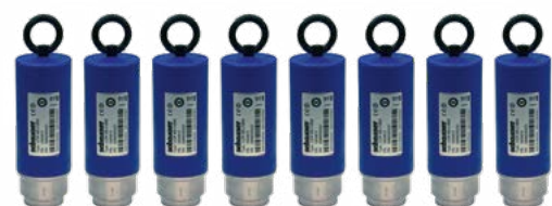
Offline measurement with up to 8 multi-sensors